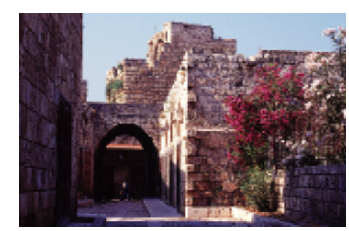
Fortress at Byblos

Chemical Synthesis Molecular Recognition Quantum Mechanics Computational Mechanics Material Science Optimization Modeling and Simulation Signal and Image Processing Smart Engineering Applied Symbolic Programming Numerical Methods